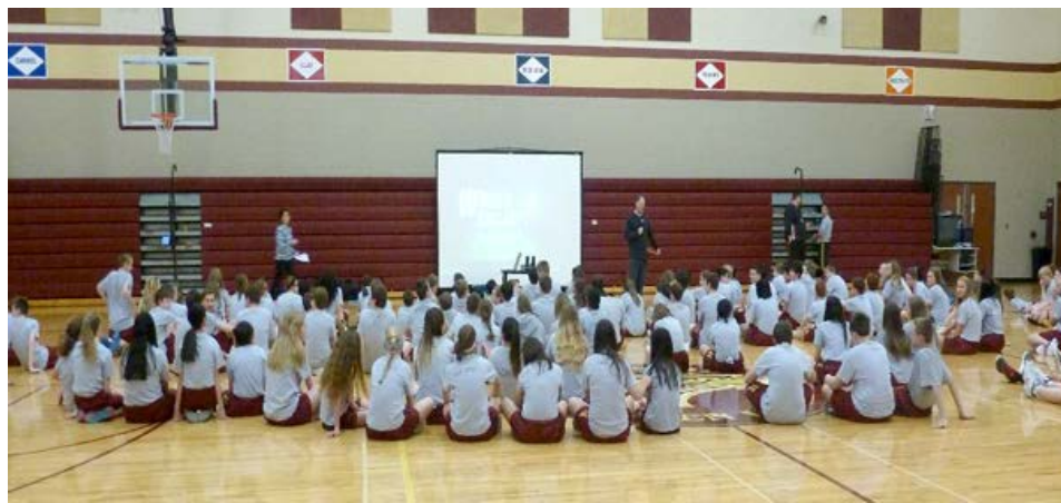
Kids that participate during the recent all-day cricket camp.